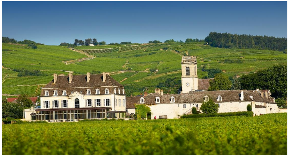
Château de Pommand

Visit and wine tasting at Château de Pommand. Along Burgundy's prestigious Route des Vins, take a break at the Château de Pommand and step into the fascinating world of exceptional wine estates. The charm of old stones and traditional Burgundy roofs combine with the power of Salvador Dali's bronze masterpieces adorning with the Cour Carrée, The Unicorn and Saint George and the Dragon.