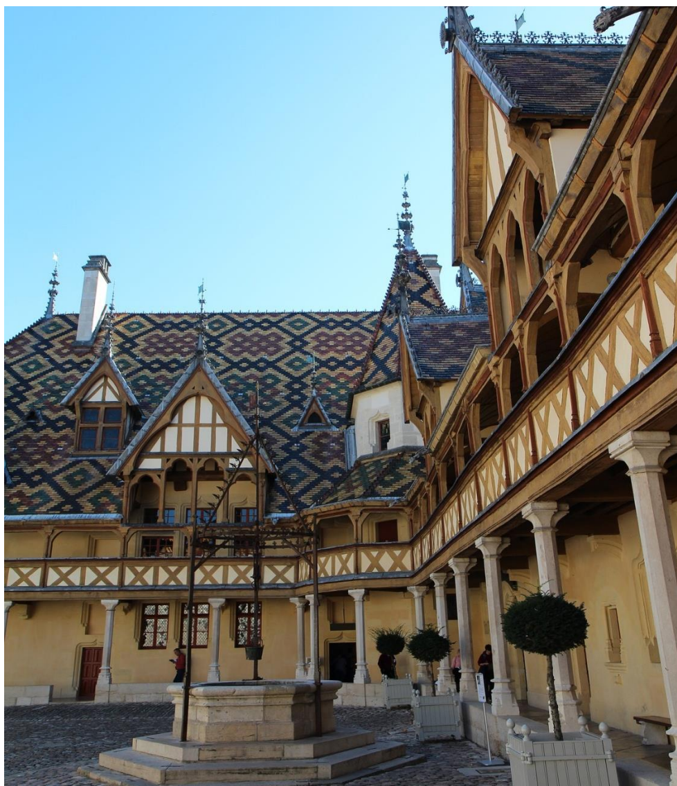
Hospices de Beaune

You will arrive in the medieval town of Beaune. Nestled in the heart of one of France's most famous vine growing regions, Beaune offers visitors the chance to appreciate the riches of history and the long-standing French traditions of fine food and wine. You will explore the medieval ramparts, the Collegial Church, and the shaded cobble-stoned streets and squares, with charming boutiques and cafes. The tour will include the visit of the incredible Hospices de Beaune, a spectacular hospital, built in the 15th century.