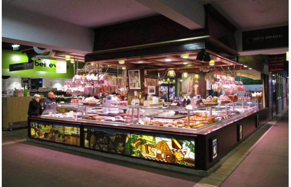
Halles de Lyon

Visit Les Halles de Lyon. The most important indoor market in the city centre, Les Halles de Lyon group 58 merchants and 9 restaurants. Since 1917, this centre of gastronomy in Lyon has brought together the excellence of the culinary professions that contribute to the international reputation of French cuisine.