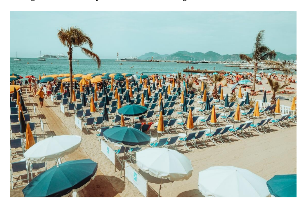
This afternoon and evening are at your leisure in Nice.

Continue onto Saint Paul de Vence , one of the most beautiful villages in Provence. You will learn to play the local boules game and will enjoy wine tasting in a 14th-century wine cellar of the village.